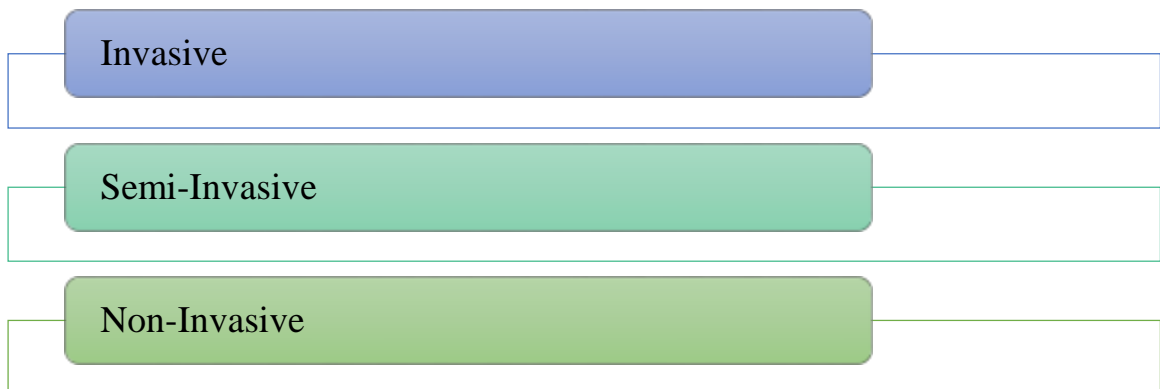
Fig.3 Brain Acquisition Techniques

Signal Acquisition: This stage captures the brain signals; signal acquisition is the process of acquiring brain signals using a particular sensor modality. The signals are amplified to makes suitable for electronic signal processing. The signals are then digitized and transmitted to a computer system for further analysis. First part of figure-2 identifies this process.[7] There are three general classes of brain acquisition techniques: invasive, semi-invasive and non-invasive interfacing technique, as shown in figure-3. In invasive technology, electrodes are surgically implanted inside the user’s brain, in semi-invasive technology electrodes are implanted over the surface of the brain, and in non-invasive techniques; the brain activity is measured using external sensing device.[8]