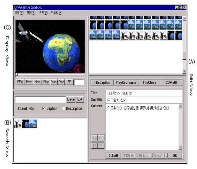
Figure 3. User Interface Screen

The editing window is shown in Fig. It is shown in 3(A). Each of them is described in terms of function. First, the editor loads the MPEG-2 video file to be edited in File Open. Then, information about the I-frame is displayed in the I-frame list window as a bitmap image in the form of a thumbnail [21]. The editor sets the I-frames that can be key frames in this I-frame table and their scope with the mouse. Then, if you click the play button on the screen, the video for the selected area is displayed on the video display screen, and the editor edits the caption information and picture description information for the key frame selected in the caption edit window and picture description edit window while viewing this video. Fig. 3(B) is a window for the search subsystem. The function of the search sub-system is largely divided into basic search and extended search, and the basic search is a search for general users to find desired information using caption and picture description information [22]. Here, and operation and or operation are supported, and the check box is used to determine whether to search with caption information or picture description information. 3(C) shows the video display window. The information found in the search is displayed as a bitmap image in the form of a thumbnail, and when a user clicks a specific bitmap here, the actual video represented by this bitmap is displayed on the display window.