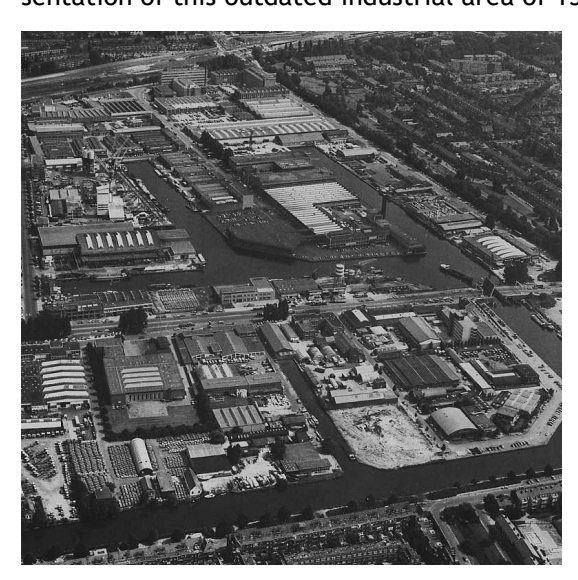
Figure 1 Binckhorst, 130 ha gross 94 ha nett 63% industrial space, 23% streets, cemetery, open grounds and harbours, 300 companies, 100 owners, 13000 working persons

Simulation is used in many contexts, including the modelling of natural systems in order to gain insight into their functioning. In the role-play game we want to imitate inter-organizational processes as well as we want students to simulate and practice in designing and planning an existing urban area (in interdisciplinary teams). An existing urban area in a Dutch city and of which the local municipality wants to transform the area in a lively urban district. We chose The Binckhorst in the city The Hague it is a representation of an inner city industrial area in decline. There are a lot of those areas in Dutch cities and it is an extensive future task for planners and designers to create adequate transformation alternatives for those areas. During and as a start from the role-play game a model (plan) gave insight in the today's functioning of the area. There was - in other words - a realistic but simplified representation of this outdated industrial area of 130 ha