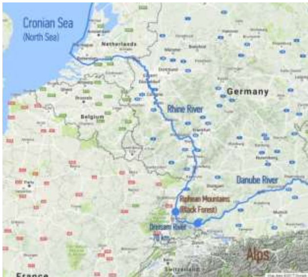
Figure 6: Danube's minimum distance from the Rhine is approximately 70 km in straight line. Their connection is possible thanks to the existence of numerous rivers rising from the Black Forest (towards both the east and the west) and of their valleys, which make the path easier, avoiding higher altitudes. Here the largest valley is chosen, the one of rivers Draisam-Elz.