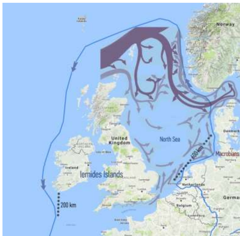
Figure 7: The route of the Argonauts in the Cronian Sea. The map indicates: 1. A part of the ocean currents of the North Atlantic Ocean (red color). 2. The Argo route from the estuary of Rhine (Rotterdam) to the circumvention of Iernides islands (Great Britain and Ireland). 3. The six-day sailing of approximately 600 km towards the Macrobian. 4. The route of 200 km south of Ireland, during which they could not see any land.

Concerning the tribe of the Macrobian s there are the following references in the ancient literature: