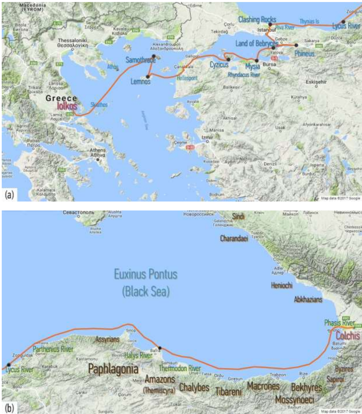
Figure 1: (a) The route followed by the Argonauts from Iolkos to the Symplegades, the Clashing Rocks. Places and tribes they reportedly passed from or met with are indicated. (b) The route followed by the Argonauts from the “Clashing Rocks” to Colchis. The tribes whose regions are known today are indicated

Advancing next to the southern shores of the Black Sea, the Argonauts passed from Paphlagonia to the country of the Amazons, Themiscyra, drained by Thermodon River (now Terme). Several other tribes inhabited the regions adjacent to it, from the east: Chalybes, the Tivarene nations, Vecheiroi, Macrones,