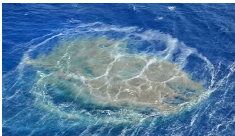
Figure 13: The El Hierro submarine volcanic eruption in Canary Islands in 2011 (Spain).