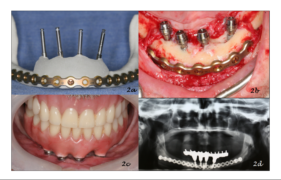
Figure 2. Treatment sequence. (a) Reconstruction plate adapted to biomodel, and surgical osseous guide to aid in the placement of the implants and the plate during the surgery. (b) Intraoral photograph during the surgery, showing adapted and screwed plate, four implants placed in the inter-foramina region, abutments and it's protection cylinders installed. Note the integrity of the mental nerve bundle. (c) Prosthesis placed 48 hours after the surgery: an upper complete denture and a lower fixed hybrid prostheses, 3 months after. (d) 36 months follow-up panoramic radiograph.