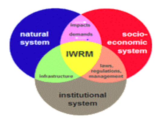
Figure 5: Interactions among the natural, administrative, and socioeconomic water resource subsectors and their environment (Adapted from MSDGC Manual, 2012)

requirements, and deals with the building of management capacity. Integrated water resources management is a process which promotes the coordinated development and management of water, land, and related resources, in order to maximize the resultant economic and social welfare in an equitable manner without compromising the sustainability of vital ecosystems (GWP, 2000).