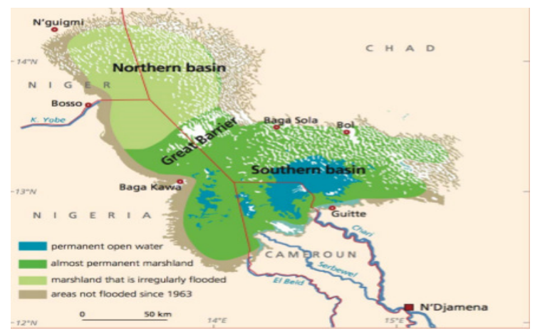
Figure 3: Schematic map of Lake Chad's average status in 2010 (Lemoalle, 2015)

The history of drought in the Lake Chad basin is defined by its changing rainfall patterns. From the middle of the 1960s, rainfall started to drop intermittently until the droughts of 1972 - 1975 which coincided with the shrinking of the basin to 10,700 km² from its initial level of 25,000 km² in 1963. Another drought of 1982 - 1985 resulted in a drop in basin area to 1,410 km², and now it covers an area of less than 1000 km², the lowest basin surface level recorded over the past 100 years (GIWA, 2004). During this time period half of the loss is attributed to a continued decrease in precipitation; the remaining half is due to a large increase in irrigated agriculture. Figure 3 shows the extent of shrinkage of Lake Chad since 1963.