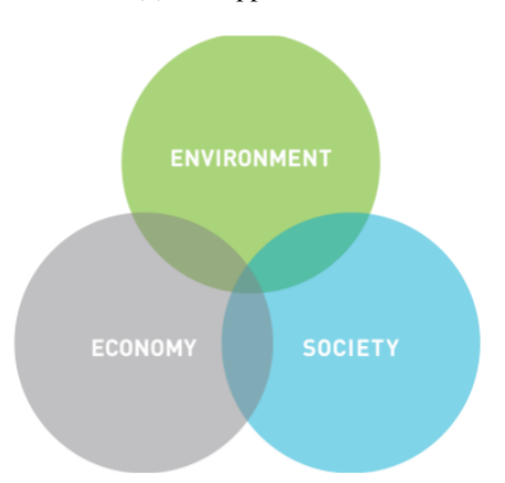
Figure 2: Pillars of sustainability (Adapted from the United Nations General Assembly, 2005)