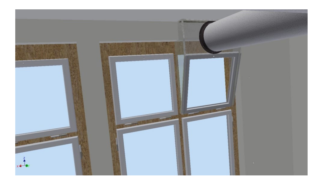
Figure 1: CAD model of a ventilator box built from polycarbonate double web panels and aluminium corner profiles suitable for conservation-protection and the thermally-insulated connection of the extractor fan to a bottom-hung window. The window remains fully functional and can be closed via the existing OL90 control system outside of class time so that there is no additional heat loss.