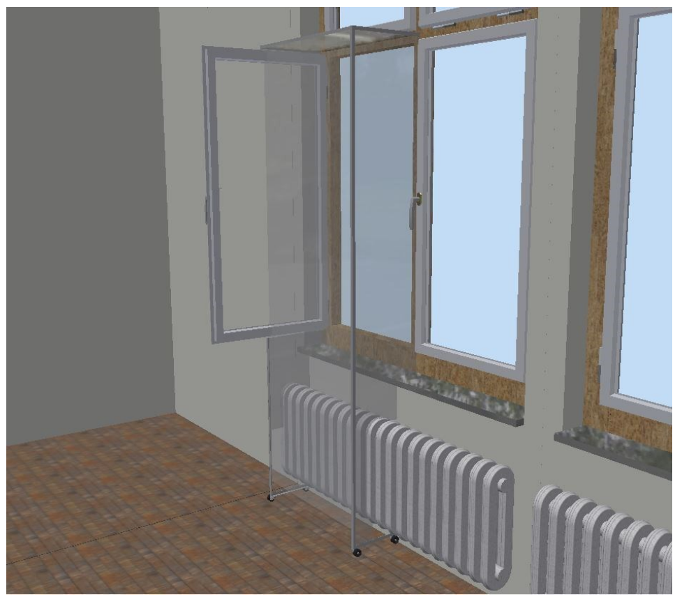
Figure 2: CAD model of a movable (rollable) draught projection system built of polycarbonate double-webbed sheets, aluminium corner profiles, and furniture casters for historic-building-preservation, draught-reduction and the thermally comfortable introduction of fresh air from a window to the floor (via fully or partially opened turn-only window or laterally tilted window). The window remains fully functional and can be closed outside lesson time so that no additional heat loss occurs.