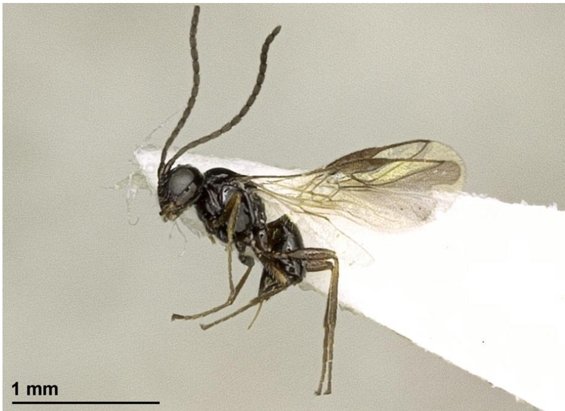
Figure 4. Phaedrotoma scaptomyzae (Fischer, 1967): habitus, lateral view (female).