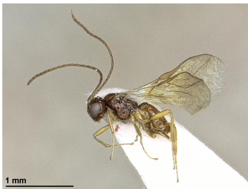
Figure 2. Opius (Cryptonastes) gracilis Fischer, 1957: habitus, lateral view (female).

Distribution in Iran: Sistan & Baluchestan (Khajeh et al., 2014) and Kerman.