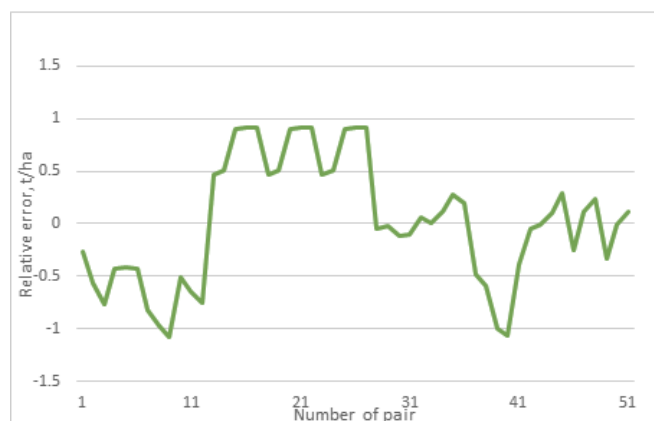
Figure 2. Relative errors of the model for stevia fresh biomass yield depending on plant density (artificial neural network computation).