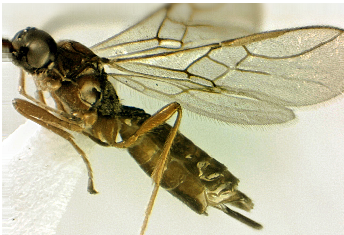
Figure 2. Habitus of Chorebus (Chorebus) ruficollis (Stelfox, 1957) (female).

Diagnosis: Eyes greatly converging below. Genae in lateral view slightly projecting angularly. Mandibles not broadened. Antennae 31–32-segmented. Flagellar segments twice as long as its maximum width. Sides of pronotum entirely sculptured and covered by hairs. Precoxal suture smooth almost straight. Radial vein not uniformly arcuate but in apical half with S-shaped bend or straightened. Legs yellow. Hind coxae with distinct tuft of hair above. First metasomal tergite with hardly pubescent hairs.