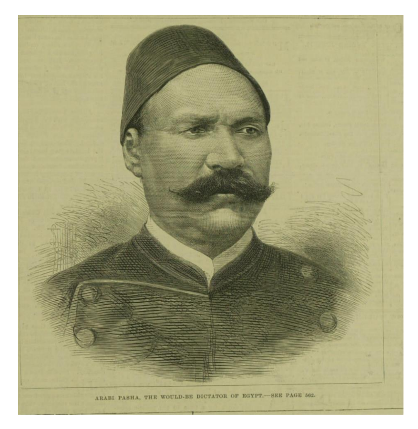
Image 4: Illustrated London News . (1882) Arabi; The would-be dictator of Egypt. Available at 'The Crisis in Egypt' (1882) Illustrated London News, 10 Jun, 562+,

Graphic arts and photography participated in the creation of a new orientalism; they conveyed and reinforced the idea that the west was in a better position to show and exhibit the Orient because of its scientific advance. Newspapers gave illustrations and photographs a political dimension and propelled the orient into a geopolitical context. What a photograph denoted was more related to political decisions, colonial and economic interests. The Orient became the Middle East and Egypt became the Egyptian Question or the Egyptian crisis and a source of instability and conflicts, thus leading to the demystification of the 'Orient'. The publication of sketches or photographs on Egypt, while dealing with the political and military situation in Egypt, gave the Orient a dimension far from the fantasies conveyed through the commercial photographs. As far as Egypt is concerned, the images