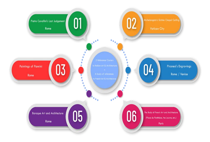
Figure1: Reference Clusters to Art and Architecture in La Modification

The account and development of the romantic entanglement between Léon and Cécile is inseparable from their artistic excursions all over Rome. The reader of the novel can see that the central character, Léon, engages in cultural pursuits whether in Rome or Paris.