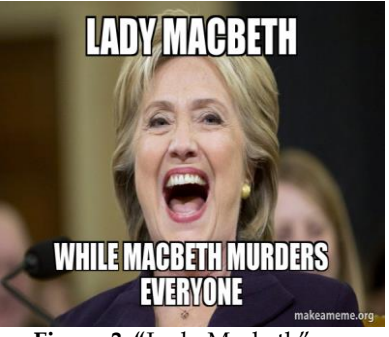
Figure 3. "Lady Macbeth" meme