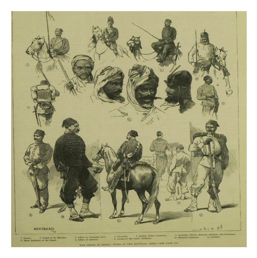
Image 3 : Montbard. (1882) The Crisis in Egypt: Types of the Egyptian Army. Available at 'The Crisis in Egypt: Types of the Egyptian Army' (1882) Illustrated London News , 03 Jun, [533]].

However, the one on the constitution of the Egyptian Army was worth a military document on an enemy's army (image 3). It was published out of a military crisis caused by the officer Arabi Pasha who presented a list of political claims concerning the Egyptians in the army and asked for reducing foreign influence in his country. The illustration of Arabi Pasha below and depicting him as ' The would-be dictator of Egypt ' was far from reassuring readers about the intentions of the man. The debate on the military intervention of Britain in Parliament and the hesitation of The Prime minister Gladstone was faced by illustrated arguments which favoured the military intervention.