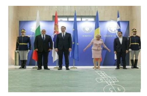
Figure 10. State officials' meeting meme.