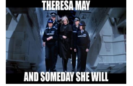
Figure 4. "Game of Thrones" meme

Figure 5. "Action Theresa" meme