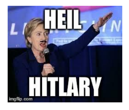
Figure 1. "Hillary Hitler" memes [2].