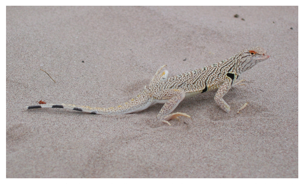
Figure 6. Uma essul (male). Dunas de Bilbao, Viesca, Coahuila. Species endemic to Coahuila.