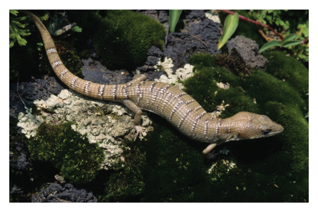
Figure 4. Gerrhonotus lugoi . Cuatro Ciénegas, Coahuila. Species endemic to Coahuila.

Pseudoeurycea galeanae, P. scandens, Eleutherodactylus longipes, Ecnomiohyla miotympanum, Barisia ciliaris, Phrynosoma orbiculare, Sceloporus minor, S. oberon, S. parvus, Plestiodon dicei, Scincella silvicola, Pituophis deppei, Storeria hidalgoensis, and Thamnophis exsul). These species enter Coahuila only in the southeastern corner of the state.