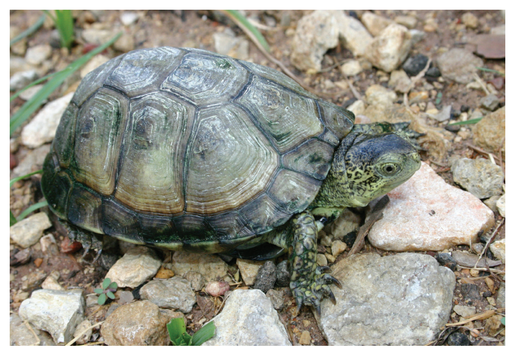
Figure 2. Terrapene coahuila . Cuatro Ciénegas, Coahuila. Species endemic to Coahuila.