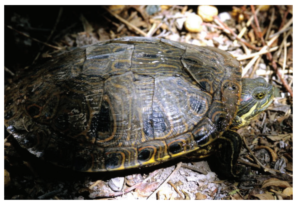
Figure 3. Trachemys taylori . Cuatro Ciénegas, Coahuila. Species endemic to Coahuila.