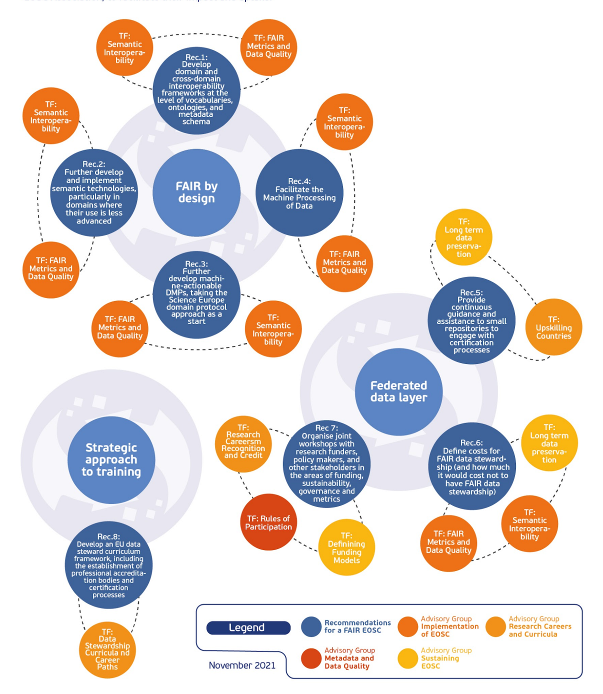
Figure 1: Eight recommendations for a FAIR EOSC, mapped to SRIA priorities and EOSC Task Forces

In this White Paper the FAIRsFAIR main recommendations are taken a step further, and mapped against three priorities identified in the Strategic Research and Innovation Agenda of the EOSC (SRIA) and the relevant Task Forces under the EOSC Association, to facilitate their impact and uptake.