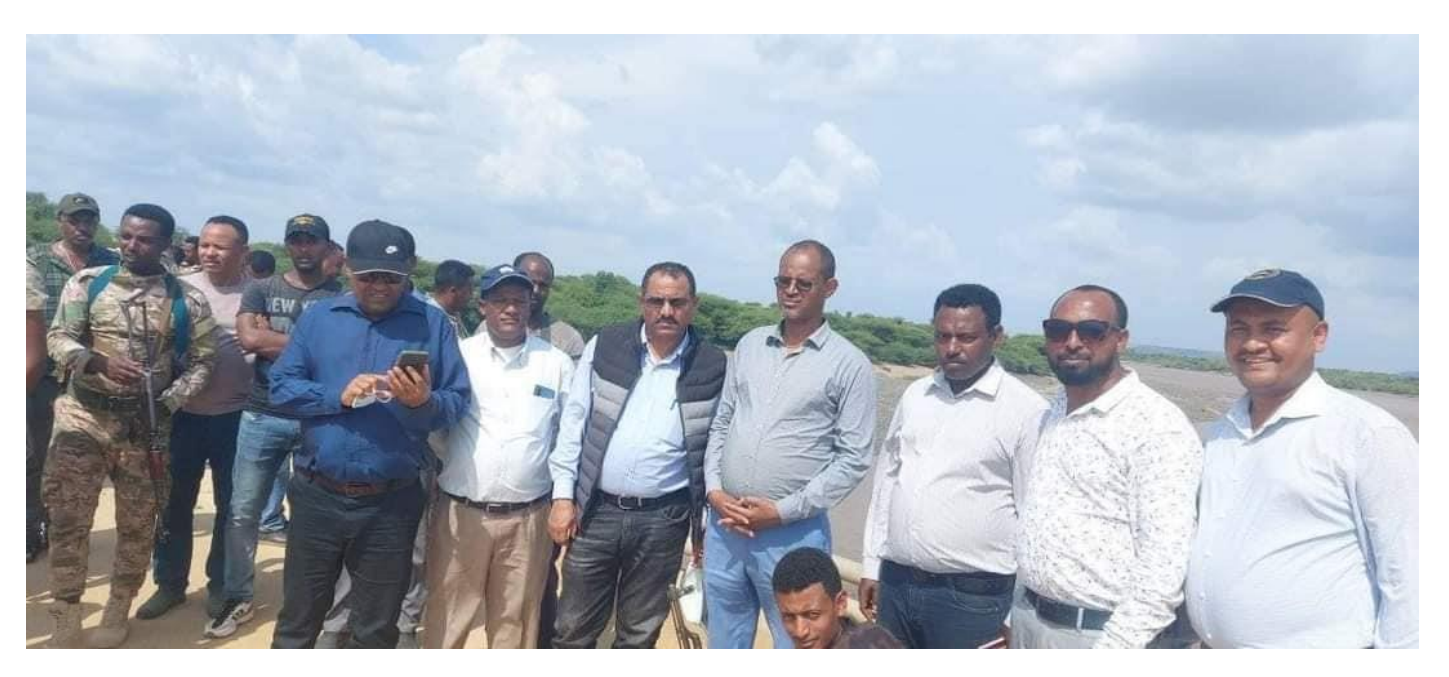
Fig. 3. Officials of Gondar, Bahir Dar (BDU), Debre Markos, Debre Birhan, Debre Tabor, Wollo, Woldiya and Debarq Universities on the Tekeze bridge in Humera<sup>105</sup>. They were on an organised visit to the armed forces in the occupied Western Tigray. The same officials have never visited their own university colleagues who are in concentration camps in Amhara Region. There is also no evidence that in Humera, they inquired about the dire human rights infringements in that town.