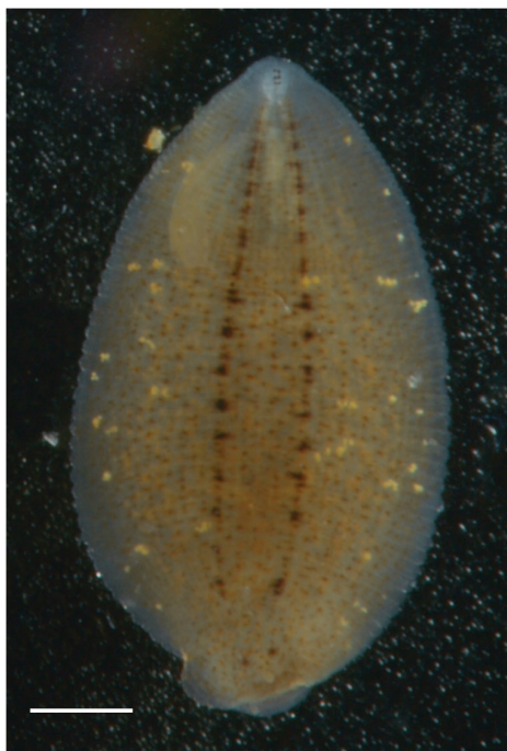
Figure 3. Glossiphonia sp. 2 from Kurma Bay of the Maloe More Strait (Lake Baikal). Scale bar 1 mm.