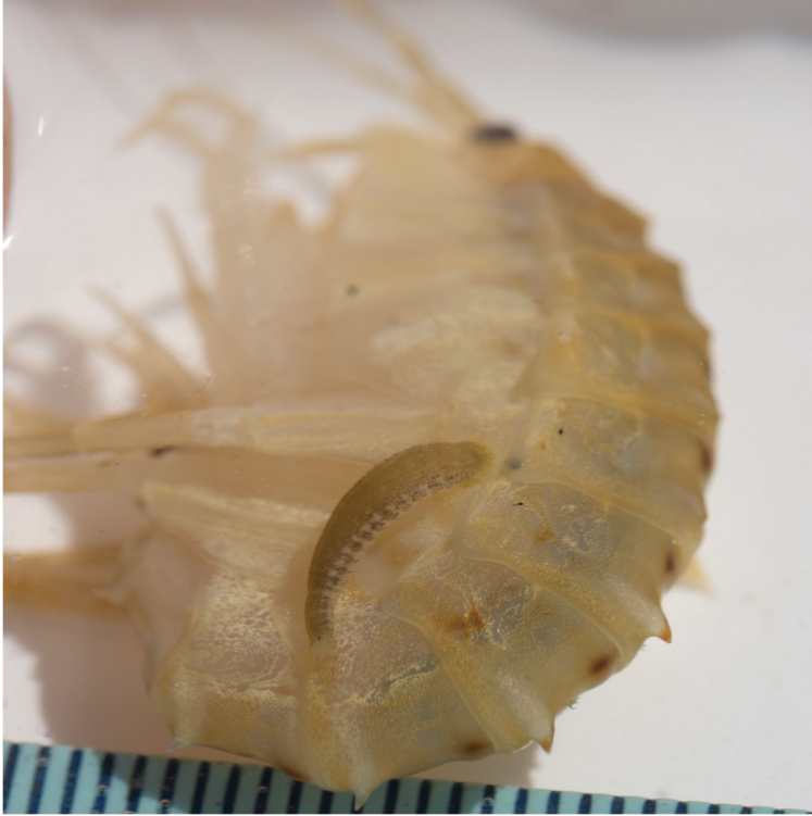
Figure 5. Codonobdella sp. on its host amphipod. The sample was found in the northern transit of the Maloe More Strait.