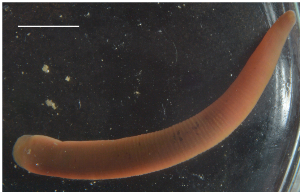
Figure 6. Erpobdella sp. 1 from Zagli Bay of the Maloe More Strait (Lake Baikal). Scale bar 5 mm.

tation is almost absent. There are only a few dark spots irregularly scattered on the dorsal surface (Fig. 6).