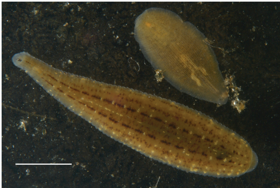
Figure 2. Glossiphonia sp. 1 (below) and Albuglossiphonia heteroclita (above) from Kurma Bay of the Maloe More Strait (Lake Baikal). Scale bar 10 mm.