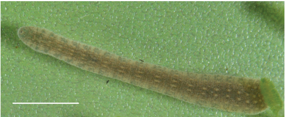
Figure 4. Theromyzon sp. individual inhabiting Ulirba Bay of the Maloe More Strait (Lake Baikal). Scale bar 5 mm.

Ecological characteristics. Representatives of this genus are known as bloodsuckers of birds (Sawyer 1986, Lukin 1976, Nesemann and Neubert 1999). The host for the Maloe More Theromyzon is unknown, since these specimens were found free-living.