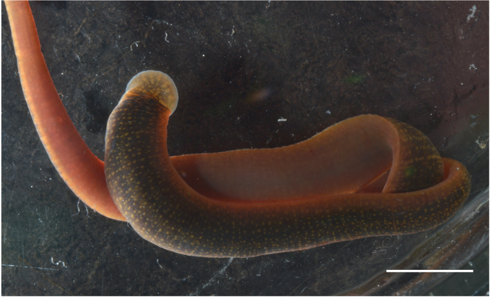
Figure 7. Erpobdella sp. 2 from Codoviy Bay (Maloe More Strait, Lake Baikal). Scale bar 5 mm.