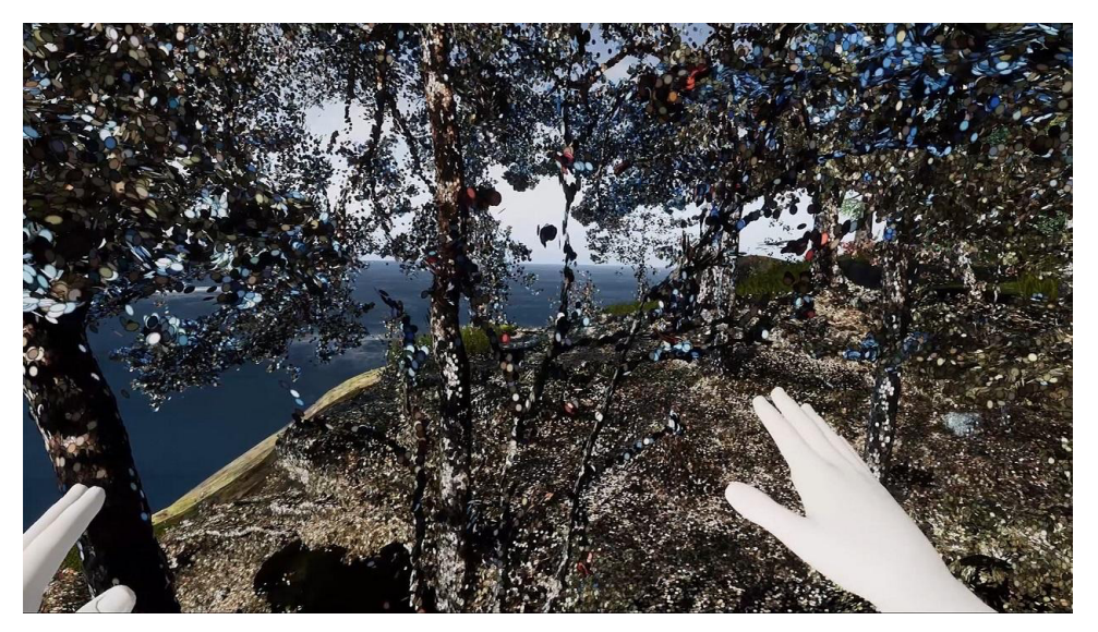
Figure 3. The virtual view of the natural environment, modeled from a laser scan.

Sounds mapped to the environments were positioned and moved in space, and in order to create both the consistency and variation the visitors would expect to hear, they were organized in 12 banks of different sound types, where the contents of each bank was cycled through in a structured, semi-random fashion before repetition took place. The structuring of material and spatialization were realized through Max and Spat softwares, as well as custom scripts for connecting position and rotation data from the game engine (used for the visual virtual environment) with the spatialization algorithms.