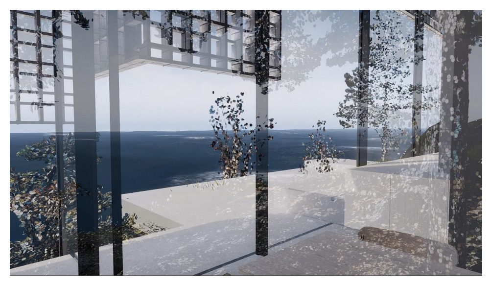
Figure 2. The architect's virtual view of the architecture, derived from the natural forms at the biotope. Figure 2 and 3 are rendered from the same perspective.

The view inside the virtual architecture necessitated a new acoustic profile different from the outdoor soundscape. A subset of the outdoor sounds was used, and some new sounds added in. The space was modeled acoustically from the architect's drawings (that were also the basis for the virtual architecture); taking spatial dimensions, materials and shapes into consideration. The intention was to meet visitor expectations of a distinct change in the sound environment when inside. The acoustic modeling of the indoor environment was additionally modified with variables from visitor position, rotation and movement in the installation, which made the acoustics behave as in a physical building. The variation in acoustics was significantly more detailed than what would have been feasible with the more general methods utilized in most reverb packages for music composition. The result was intended to provide an increased the sense of realism in relation to the visual imagery.