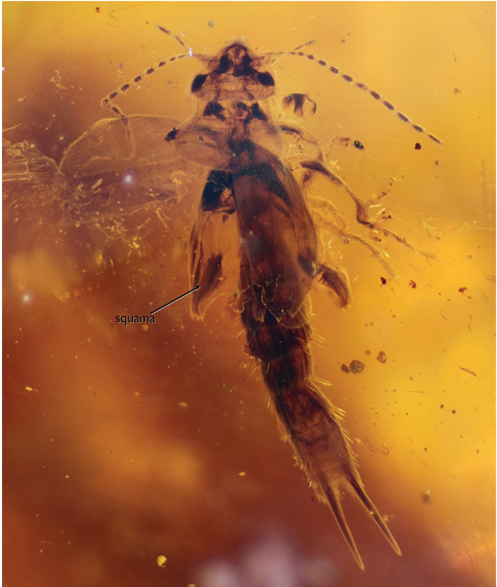
Figure 1. Dorsal aspect photomicrograph of holotype female of Astreptolabis ethirosomatia gen. et sp. n. (AMNH Bu-FB20). In this orientation the head is slightly dipped forward making the postocular area appear minutely foreshortened relative to the compound eyes.

soventrally compressed (Fig. 2), with sparsely scattered setae, not chaetulose; integument dull and matt. Head prognathous, slightly broader than long (estimated as direct dorsal view of specimen not possible: Fig. 2), somewhat tumid, posterior angles rounded, posterior border relatively straight, rounded (not truncate or concave); compound eyes well developed, somewhat prominent, separated from posterior border of