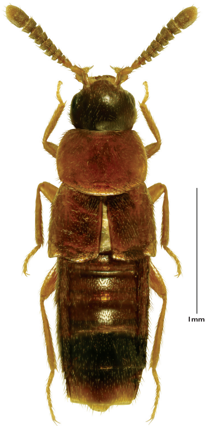
Figure 1. Oxypoda stanleyi Klimaszewski & McLean, sp. n., dorsal habitus.