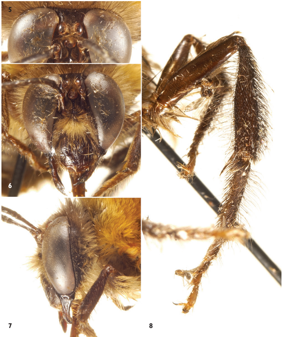
Figs. 5-8. Male of Caupolicana (Zikanapis) wileyi sp. n. 5) Ocellar view. 6) Facial view. 7) Lateral aspect of head. 8) Hind leg.

labrum with minor irregularities, not punctures. T5 and T6, except for smooth apical marginal zones, coarsely and rather closely punctate in contrast to preceding terga.