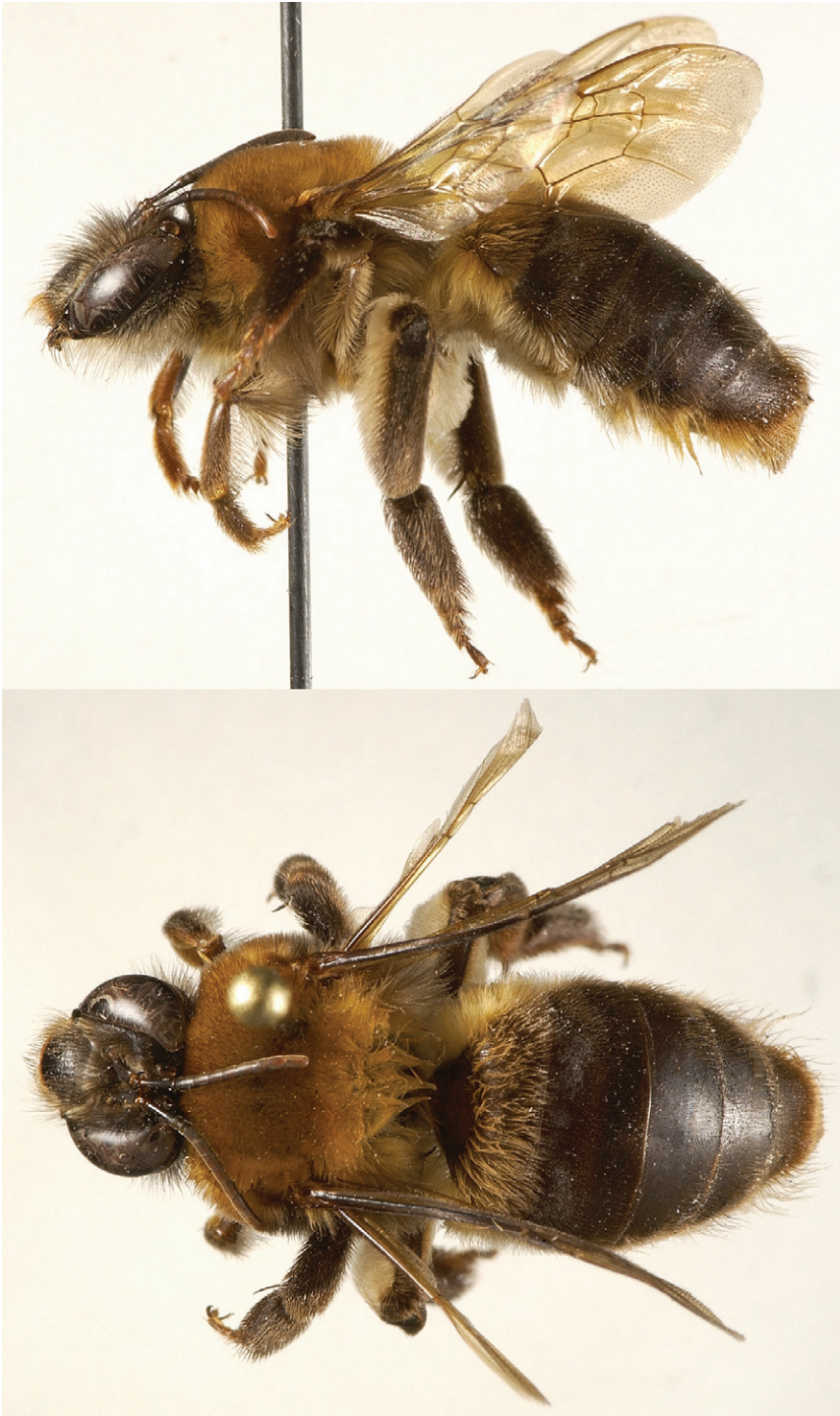
Fig. 1. Lateral (above) and dorsal (below) views of female of Caupolicana (Zikanapis) rozenorum Michener, Engel, and Ayala.