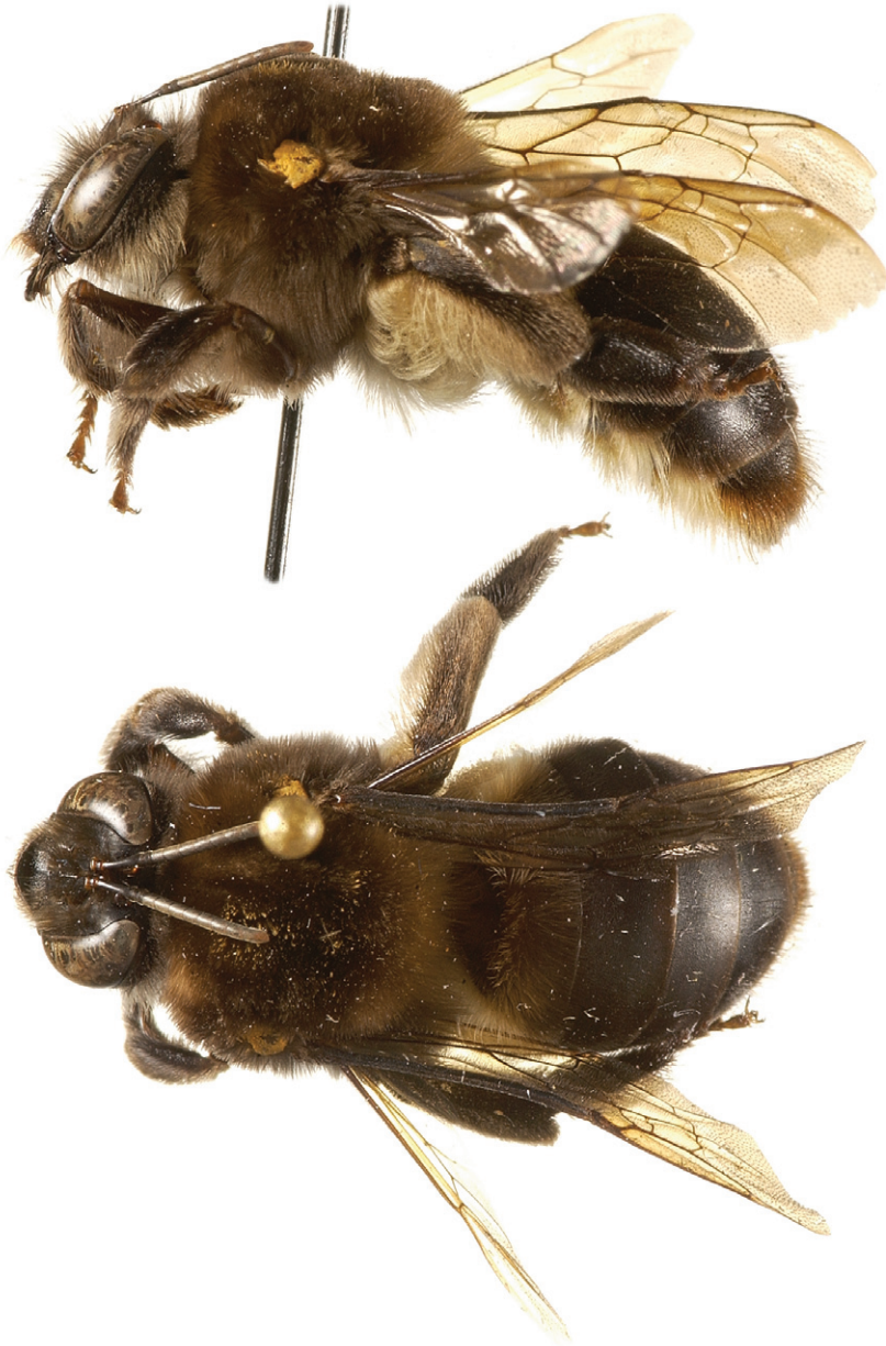
Fig. 13. Lateral (above) and dorsal (below) views of female of Caupolicana (Zikanapis) wileyi sp. n.

ochraceous on under surface of midleg; setae of protibia and protarsus dusky to ochraceous. Setae of T1 whitish below laterally, but on dorsal surface fulvous as on mesosomal dorsum; setae of T2, T3, and intermixed on T4 black, dense, suberect (most nearly erect on T2), black or blackish setae continuing onto ventrolateral parts of terga and blackish on lateral extremities of sterna; otherwise sternal setae ochraceous; T4