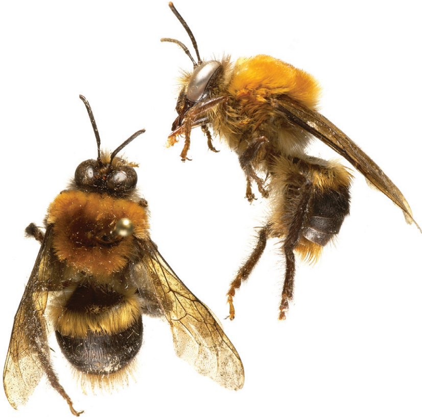
Fig. 4. Lateral (above, right) and dorsal (below, left) views of male of Caupolicana (Zikanapis) wileyi sp. n.

in some areas blackish pile of the mesosomal dorsum and T1. Metatibia of male about 4.8 times as long as greatest breadth, distal half parallel sided. S8 of male with midapical process nearly parallel sided, not slender basally as in C. inbio .