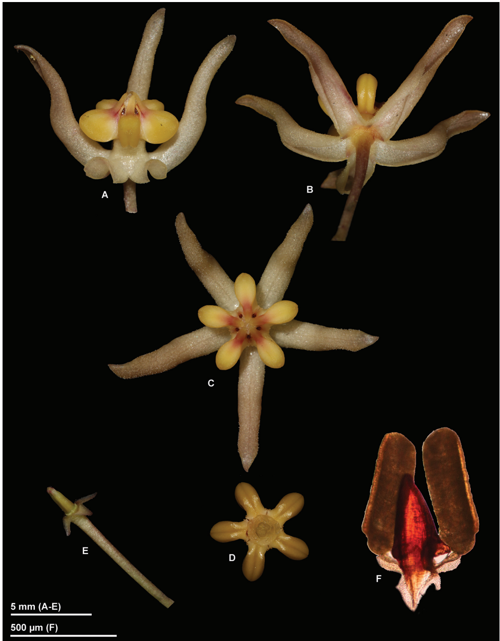
Figure 1. Hoya ruthiae photographed from Rodda M. MR606 (SING) prior to pressing A Flower, lateral view with two corolla lobes removed B Corolla, underneath C Corolla and corona, top view D Corona, underneath E Pedicel, calyx and ovaries F Pollinarium with twin pollinia.

lanceolate with a triangular acuminate apex, 9–10 × 3–4 mm, laterally revolute, lobe tips recurved. Gynostegium stalked, corona column conical 1–1.2 × ca. 2 mm diam, glabrous; corona staminal, 2.5–3 mm high, 6–7 mm in diameter, fleshy, yellow with a purple