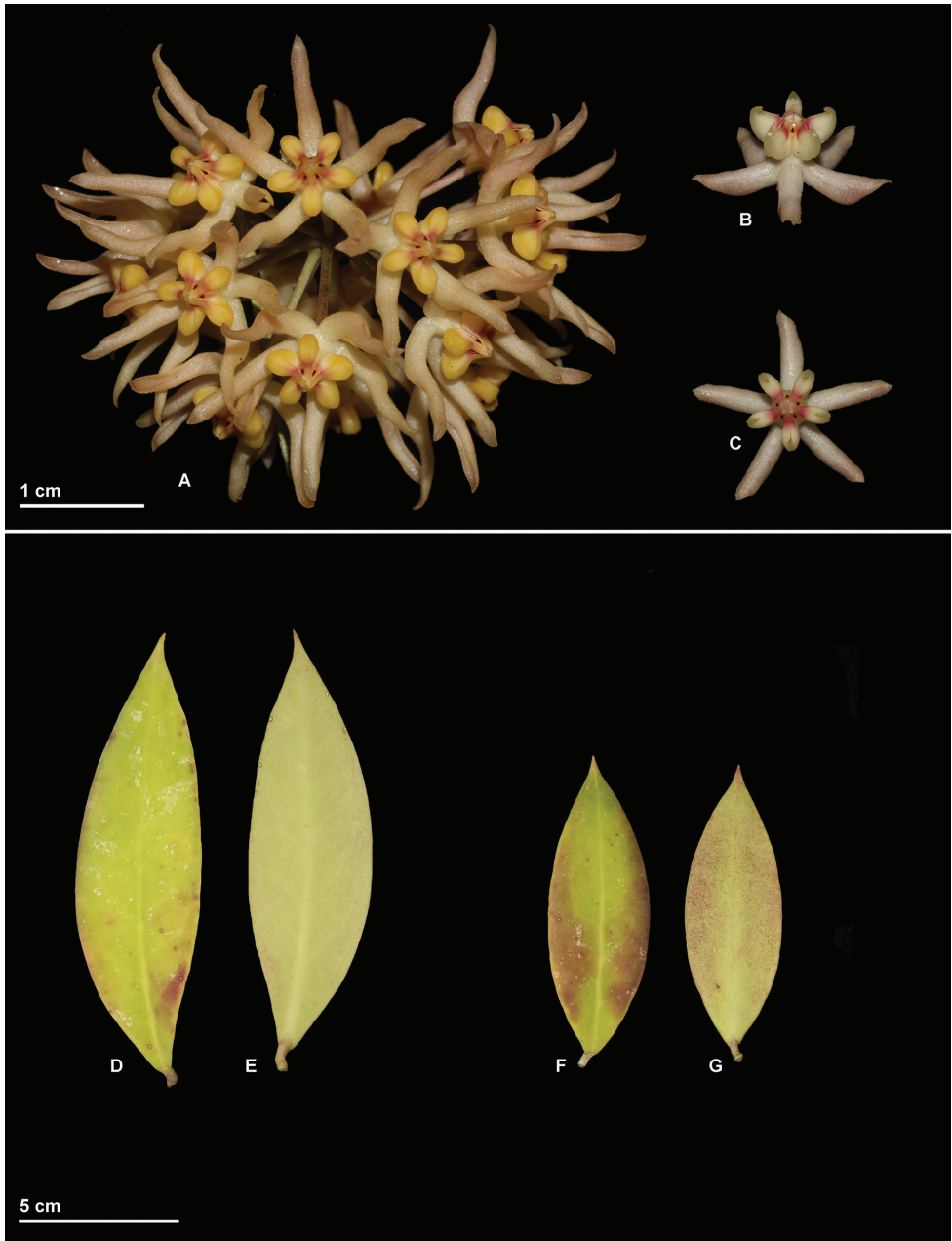
Figure 2. Hoya ruthiae photographed from Rodda M. MR606 (SING) prior to pressing A Inflorescence D, E, F, G Two leaves ( D, F adaxial surface E, G abaxial surface). Hoya uncinata photographed from Rodda M MR607 (SING) prior to pressing B Flower, lateral view C Flower, top view.