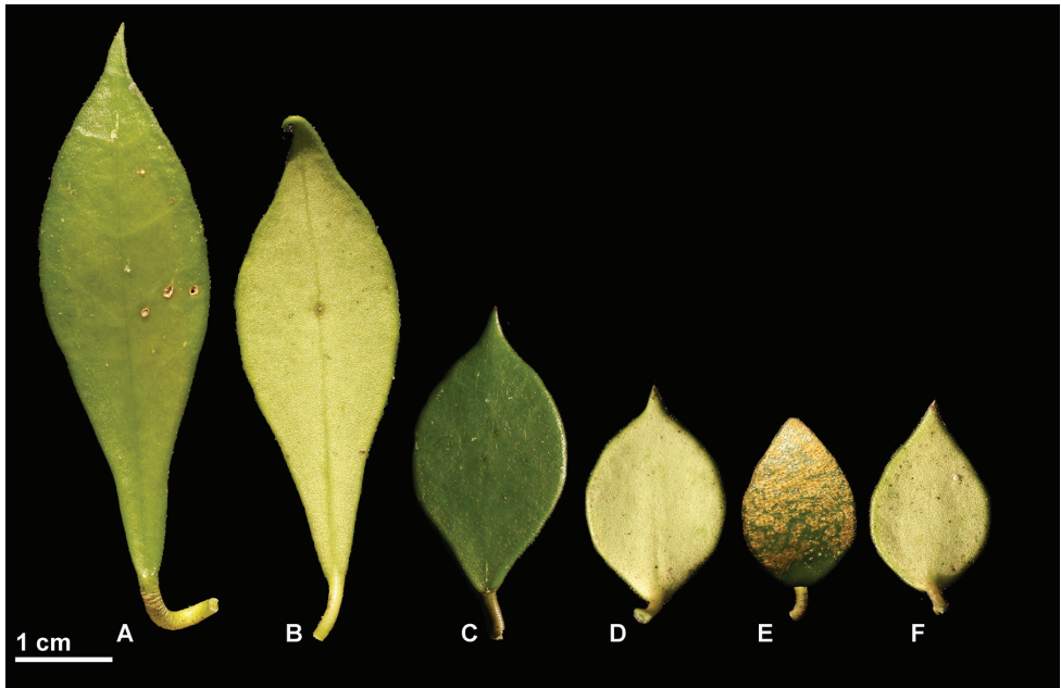
Figure 5. Hoya bakoensis leaves photographed in the field from Rodda M MR1042b ( A, B, E, F ) and Rodda M MR1042a ( C, D ) (SING) prior to pressing. A, C, E Adaxial side B, D, F Abaxial side.

Conservation status. Hoya bakoensis is locally common and well protected inside Bako National Park. Its conservation status is therefore Least Concern (LC) (IUCN 2014).