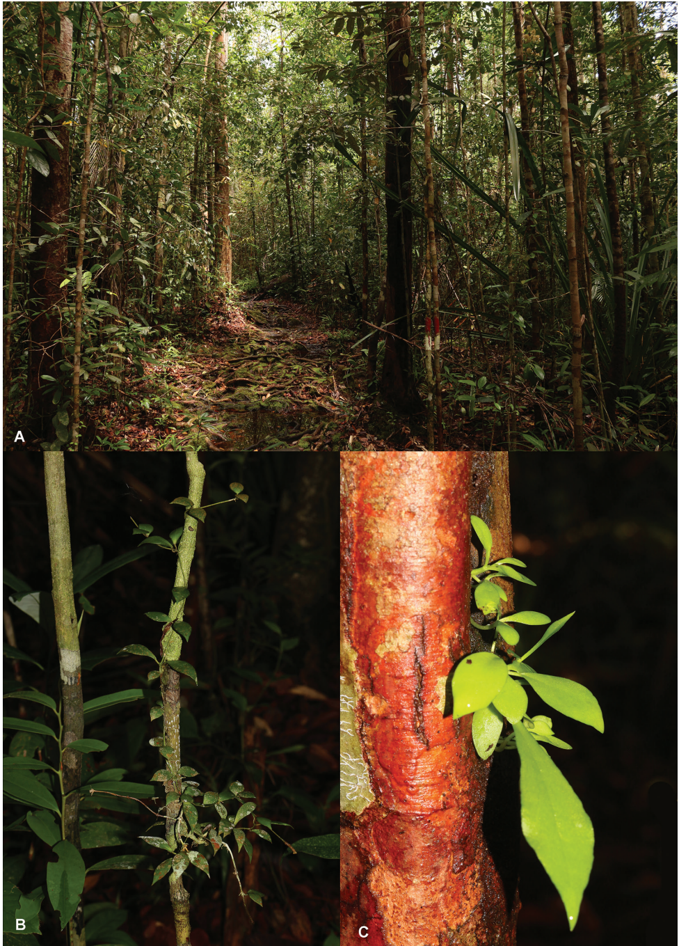
Figure 4. Hoya bakoensis in situ in Bako National Park (Sarawak, Malaysia) A Habitat, kerangas heath forest B Mature plant rooted inside the trunk of the host plant where an ant nest is located C Seedlings germinating from the opening of an ant nest in a hollow trunk.