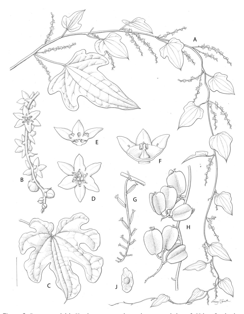
Figure 2. Dioscorea multiloba Kunth vegetative and reproductive morphology. A Habit of male plant with axillary inflorescences B Apical part of male inflorescence showing tepal shape and habit and bud shape habit C Lobed leaf showing venation of upper surface and forerunner tip D Male flower from above showing filament habit E Male flower with 3 tepals and part of torus removed showing torus shape, pistillode and associated concavities in torus surface F Female flower with 3 tepals and part of torus removed showing torus shape, staminodia and gynoecium G Female inflorescence showing tepal habit and ovaries H Infructescence showing some submature capsules with persistent tepals J Seed showing wing shape. Scale bar: A , C 3 cm; B 7 mm; D , E 4 mm; F 3 mm; G , H 2.5 cm; J 2 cm. From Ward 3076 ( A , B , D , E ), Medley Wood 329 ( F , G ), Gueinzius s.n. ( H , J ) and a photograph ( C ). Drawn by Lucy Smith.