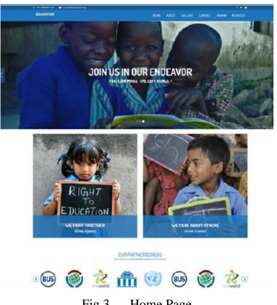
Fig 3. Home Page

Fig 2. Data flow for volunteer. Once a volunteer fills in details and registers, he/she is redirected to log in page. Upon successful login, he/she can view suggested NGOs based on the information provided.