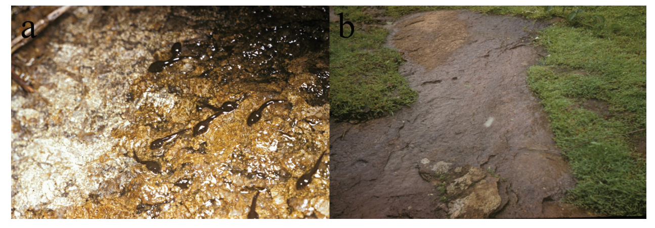
Figure 1. Habitat (right) of Amietophrynus perreti tadpoles (left) at the type locality, the Idanre Hills in Nigeria (photos: courtesy of A. Schiøtz).

terrestrial tadpoles, developing in shallow water-films on wet, sometimes vertical rocks (Schiøtz 1963; Fig. 1).