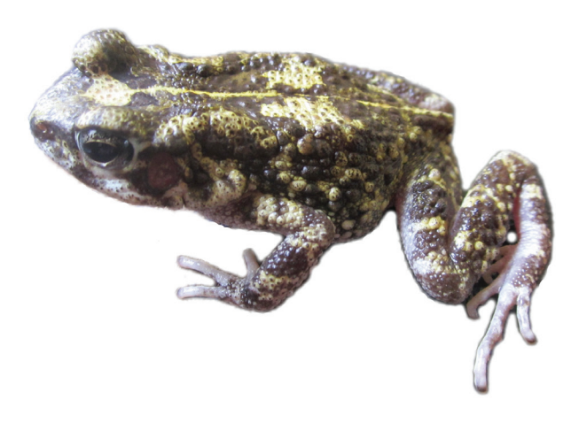
Figure 4. A specimen of the rediscovered Amietophrynus perreti from the type locality, the Idanre Hills, south-western Nigeria.

Amietophrynus perreti (Fig. 4) were observed during day and night, mainly on higher parts of the rocks. They were encountered on the hard rock surfaces and among low herbal vegetation on sandy soil between the rocks. During October 2013 we observed a total of 31 A. perreti , 16 during the day (12 person-hours search time, Table 1) and 15 during the night (6 p-h). In March 2014 we