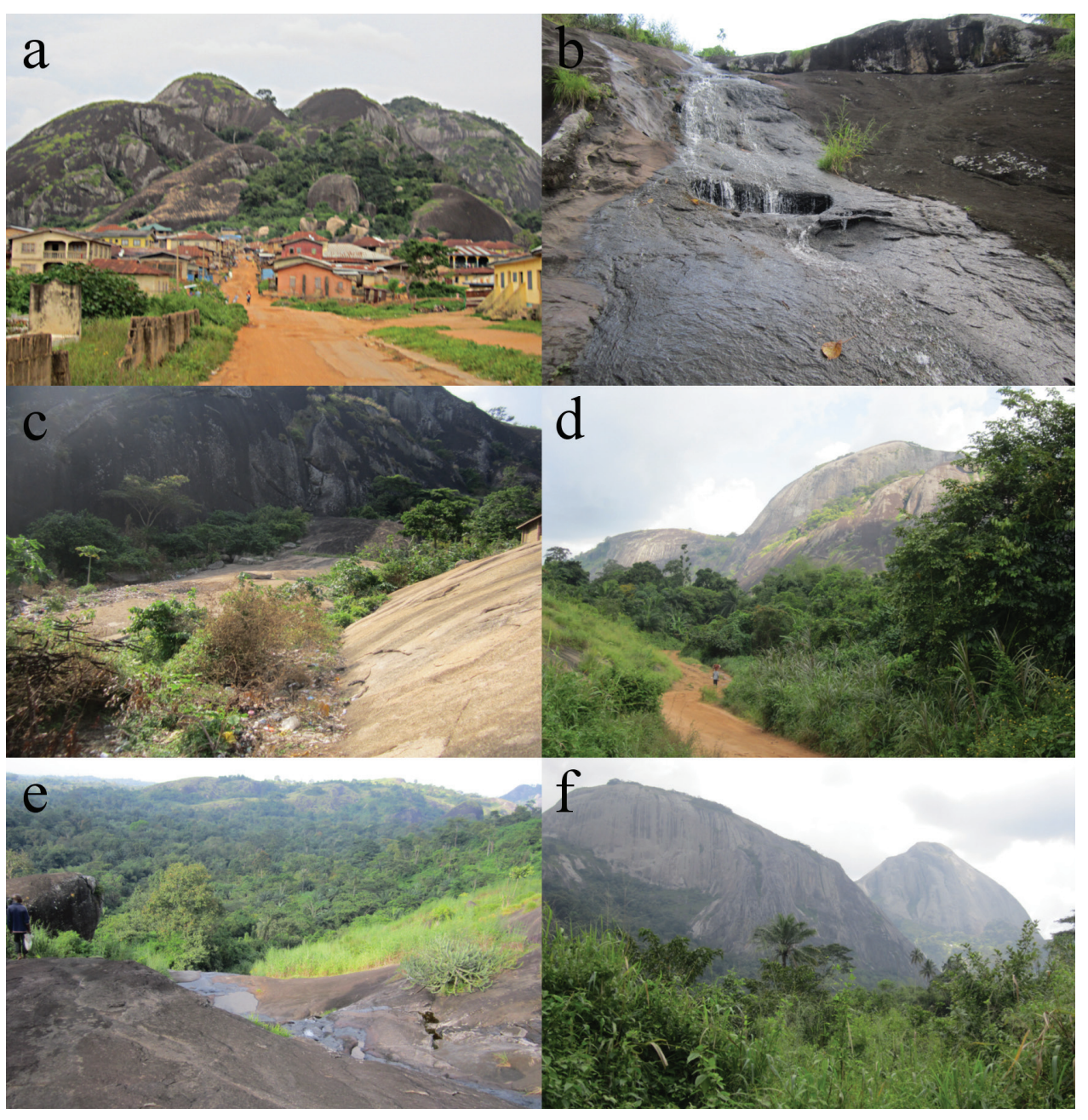
Figure 2. The Idanre Hills inselbergs in south-western Nigeria (a-f), the type locality and only known habitat of Amietophrynus perreti . Survey site A was only about 50 m from the last house in a; b: figures a overflown part of rock at site B; c: some A. perreti were observed close to the waste dumping site (left at the rock base), probably feeding on flies or other insects; d: a road leading to Site C, the cocoa farm being further in the background adjacent to the large rock; e: part of site C.

Table 1. Time period and time span spent searching for Amietophrynus perreti per site in the Idanre Hills. In parenthesis total search time per site is given in person-hours.