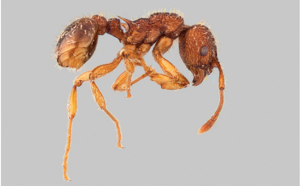
Figure 2. A worker of M. sabuleti , heavily infected with R. wasmannii on all body parts.

monophyly of these morphological species groups was confirmed using molecular data (Jansen et al. 2010). So far, only species of the rubra -group and scabrinodis -group have been found with Rickia wasmannii infection.