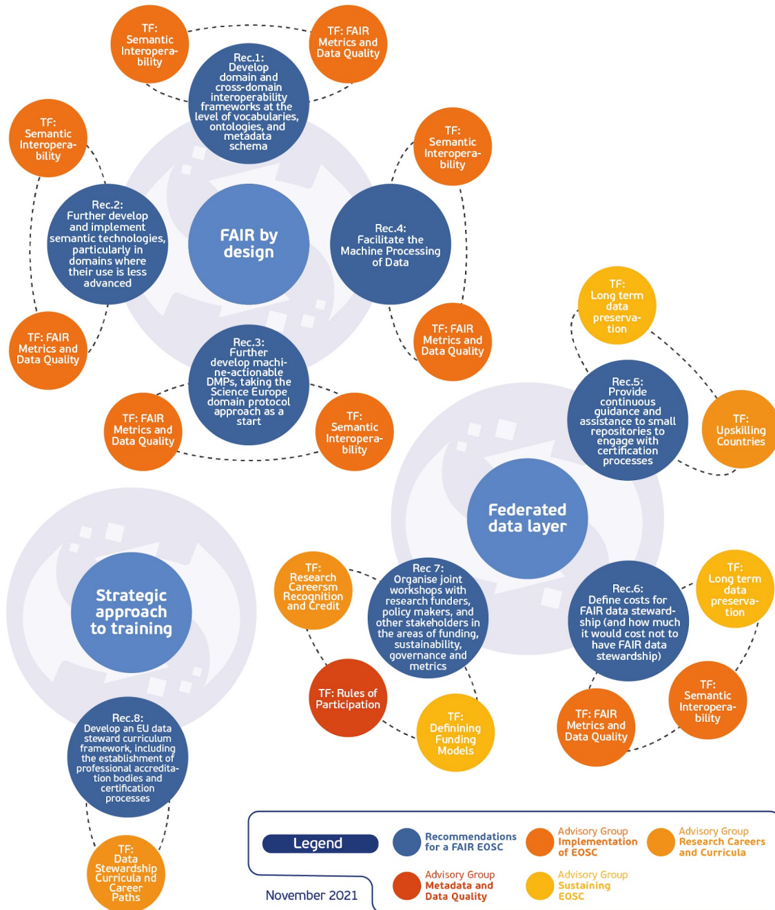
Figure 1: Eight recommendations for a FAIR EOSC, mapped to SRIA priorities and EOSC Task Forces

In this White Paper the FAIRsFAIR main recommendations are taken a step further, and mapped against three priorities identified in the Strategic Research and Innovation Agenda of the EOSC (SRIA) and the relevant Task Forces under the EOSC Association, to facilitate their impact and uptake.