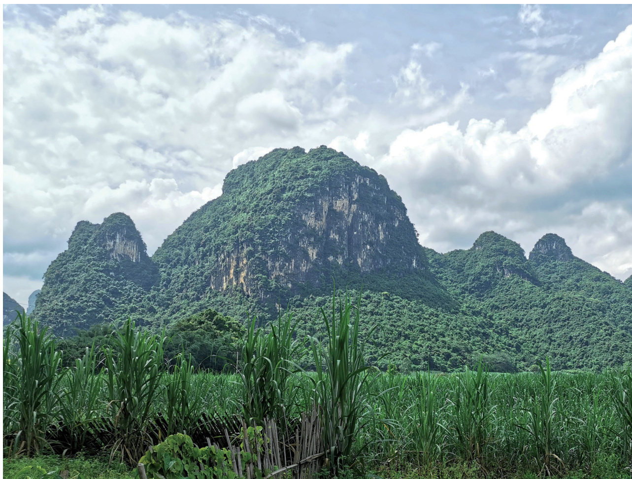
Fig. 5. Macrohabitat of Lycodon pictus in Nonggang National Nature Reserve, Longzhou, Guangxi, China.

The holotype of Lycodon pictus (IEBR 4166) could be genetically confirmed. The newly discovered specimen from the site close to the type locality in northern