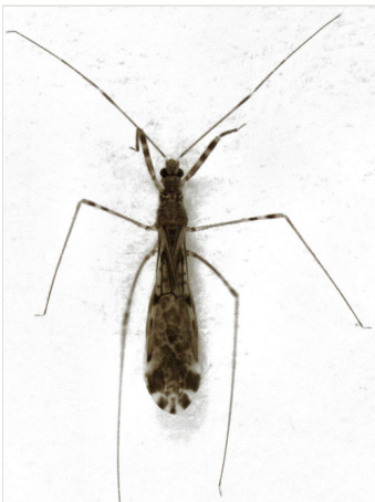
Figure 2. Emesopsis infenestra (dorsal habitus, body length about 4.5 mm)

As an aside, there is another unrecorded and as yet unidentified emesine species present in New Zealand. I collected a single specimen in Auckland Domain about 8 years ago and deposited in the New Zealand Arthropod Collection (NZAC). As I no longer have access to NZAC, I cannot check the details, but it was a large species, similar to the native Ploiaria antipoda , but fully macropterous, and clearly different to any of the known species in New Zealand. I found it crawling up a spider web covered tree trunk at night.