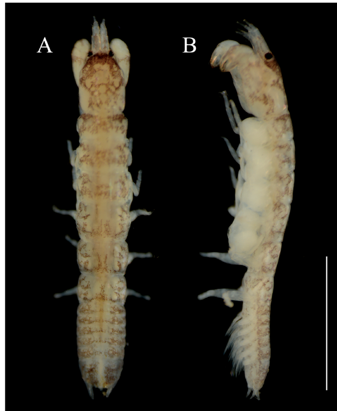
Fig. 1. Teleotanis madara sp. nov., holotype female (ICHUM-5844), ethanol fixed specimen, dorsal (A) and left (B) views. Scale: 1 mm.

congeners were measured from original illustrations if these measurements were not provided in descriptions.