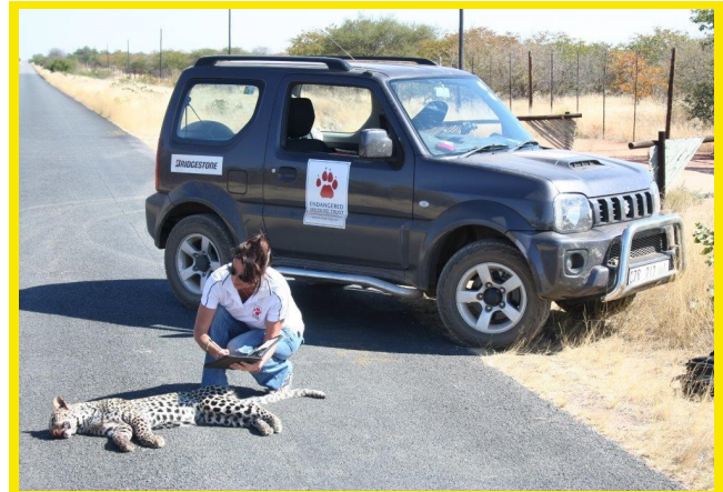
Photo 1. Example of a Leopard ( Panthera pardus ) killed in 2014 on a road within the Greater Mapungubwe Transfrontier Conservation Area (W. Collinson)

Although Leopards occur in numerous protected areas across their range, the majority of the population occurs outside of protected areas, necessitating a need for improved conflict mitigation measures, trophy hunting management, non-lethal mitigation actions, centralised monitoring of trophy harvest and quality, issuing of DCA permits as well as providing education programmes to ensure Leopards do not become locally threatened. Currently, the best conservation effect on Leopard conservation in South Africa can be made along two general fronts, namely policy development and conflict mitigation. These can be distilled into four pillars of conservation action: 1) livestock and game conflict mitigation, 2) applying sustainable trophy hunting regulations, 3) reducing the illegal trade in skins and 4) protected area expansion to create a more resilient population overall.