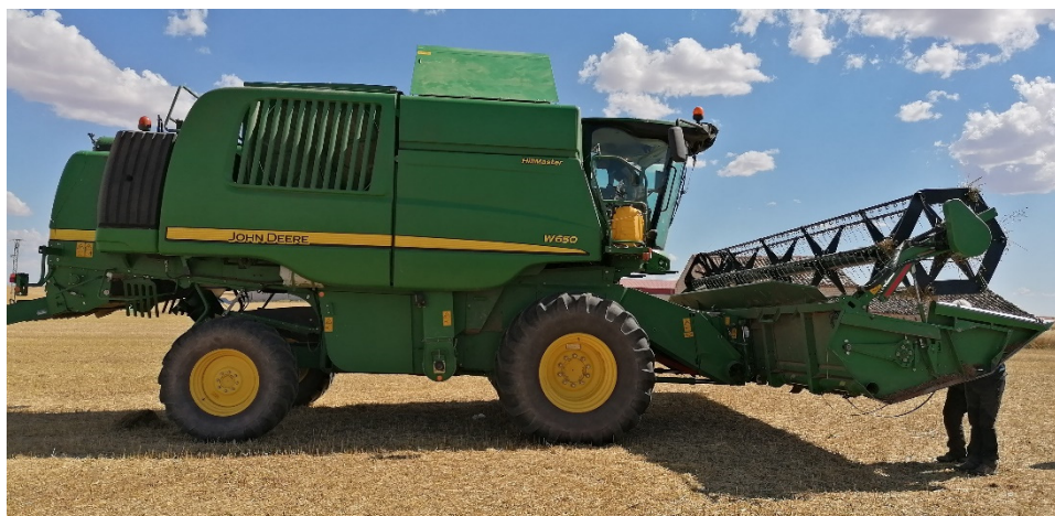
Figure 2. John Deere W650 combine harvester equipped with a cereal header.