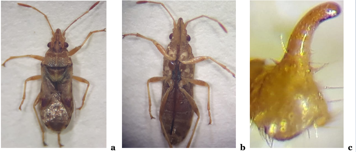
Figure 1. Belonochilus numenius (Say, 1832) a. Dorsal view b. Ventral view c. Paramere