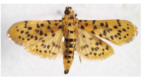
Conogethes punctiferalis adult. The wingspan is approximately 22–30 mm.