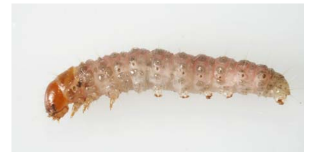
Conogethes punctiferalis larva, which reaches a maximum length of around 20 mm.