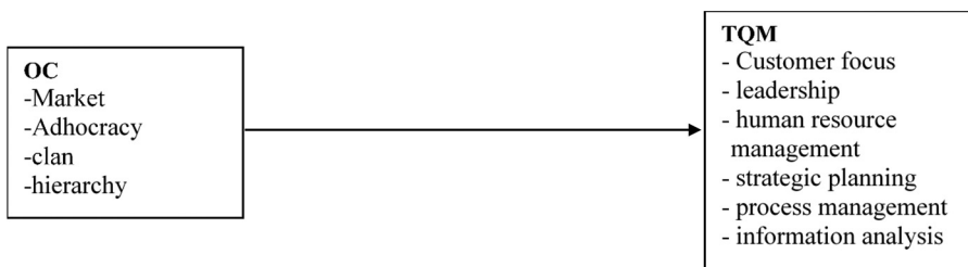
Figure 1. Research framework

Data collection was carried out using self-administered questionnaires to manufacturing SMEs managers/providers in Riyadh, Mecca and Eastern KSA. The population during the research was 5,820 (Ministry of Commerce & Investment, 2016) and Krejcie and Morgan (1970) guide to achieving the sample size in this context was 361. We used a cross-sectional design technique for the survey. Data collection was performed at a specific point in time (six months in 2017) and the calculated sample size was doubled to reduce errors and non-response problems (Hair, Celsi, Ortinau, & Bush, 2008). Therefore, 722 was the total number of questionnaires administered.