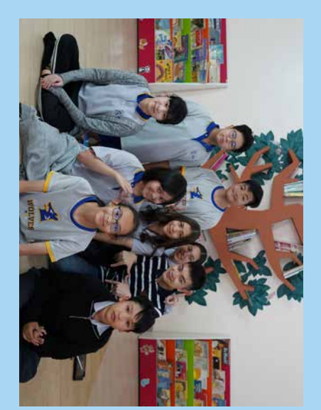
YAAR! members in Thailand