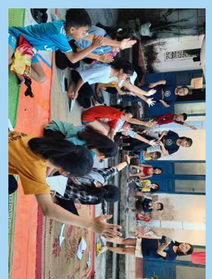
Youth project members in Vietnam held a quiz for local children on the topic of bacteria and antibiotics