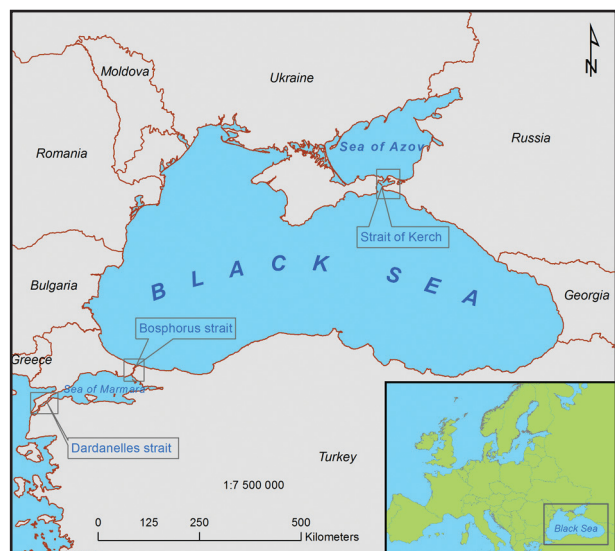
Fig. 1 Location map of the study area

The Black Sea is the largest semi-closed sea bordered by Europe to the North, West and East and by Asia to the South. It is connected by the strait of Kerch to the shallow Azov Sea and with the Marmara Sea (the Mediterranean Sea, respectively) by the strait of Bosphorus (Fig. 1). The Black Sea lies between six countries: Bulgaria, Romania, Ukraine, Russia, Georgia and Turkey.