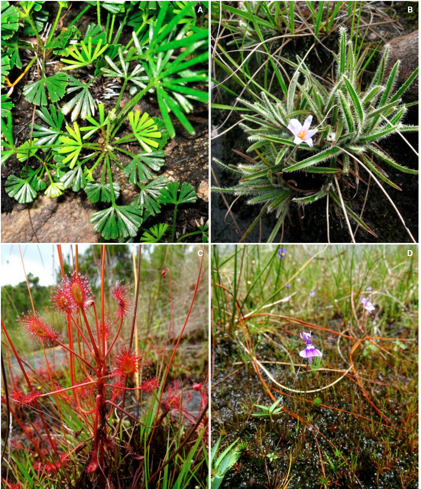
Fig. 5. – A. Actiniopteris dimorpha Pic. Serm. ( Pteridaceae ) a desiccation-tolerant species of fern at Vohidava, Ihosy; B. Xerophyta sp. ( Velloziaceae ) near Anjoman'Akona, south of Ambositra; C. Drosera madagascariensis DC. ( Droseraceae ); D. Utricularia sp. ( Lentibulariaceae ). [A: Razafindraibe et al. 300; B: Rakotoarivelo et al. 287; C: Rabarimanarivo et al. 745; D: Rabarimanarivo et al. 705]