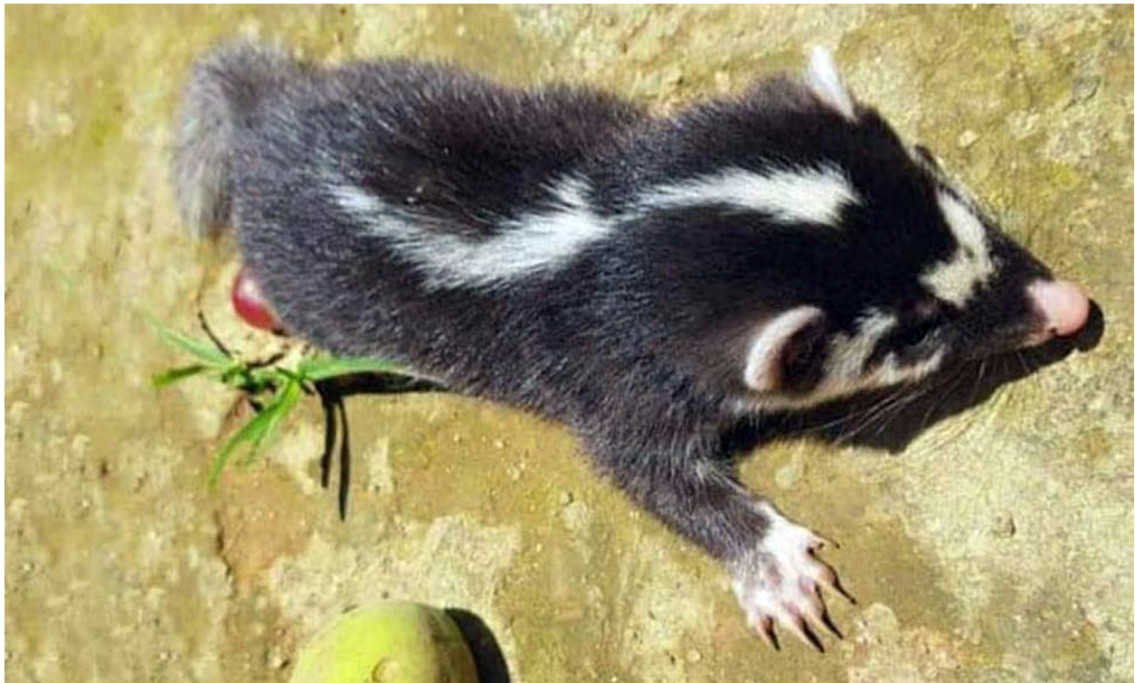
Figure 2. Melogale personata in Waling, Syangja District, Nepal.