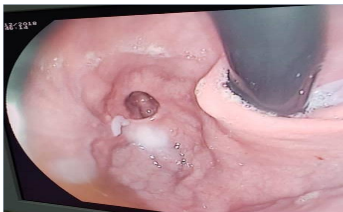
Figure 1. Diverticulum seen in gastric fundus in gastroscopy.

70-year-old male came to our clinic complaining chronic epigastric pain and dyspepsia, with no known co-morbidities, he had history of hospitalization in 1978 for this condition, he underwent endoscopy but unfortunately, he had lost the documents, and he was prescribed magnesium milk for treatment at that time. We did investigations and made esophagogastro-duodenoscopy (OGD), we found single out pouching measuring 1-2 cm in the gastric fundus (Figure 1) and also food material inside the pouch. A GD was confirmed on oral and intravenous contrast computed tomography (CT). CT reported 1.5-2 cm GD (Figure 2). Medical treatment was started and followed because the gastric diverticulum was 2 cm below. The patient is still under follow-up and has no clinical findings.