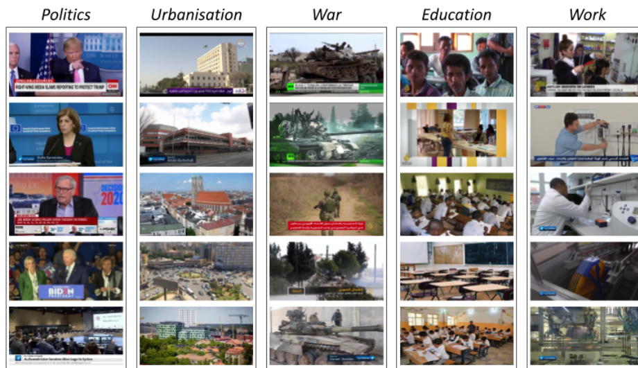
Figure 2: Example results, for five selected MRSCs. The top-5 retrieved images or video shots for each MRSC are shown.