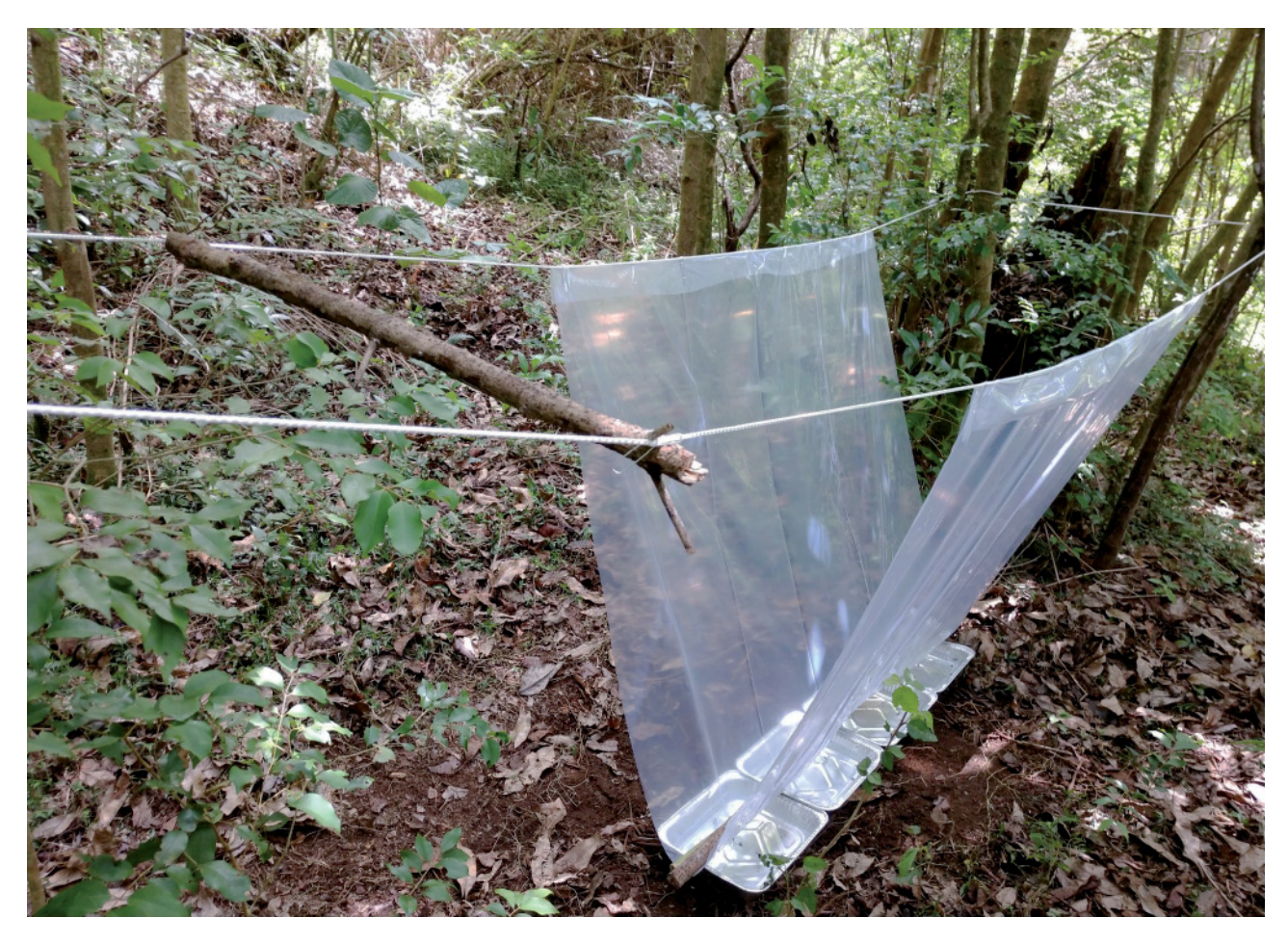
Fig. 2. Travel version of V-flight intercept trap.