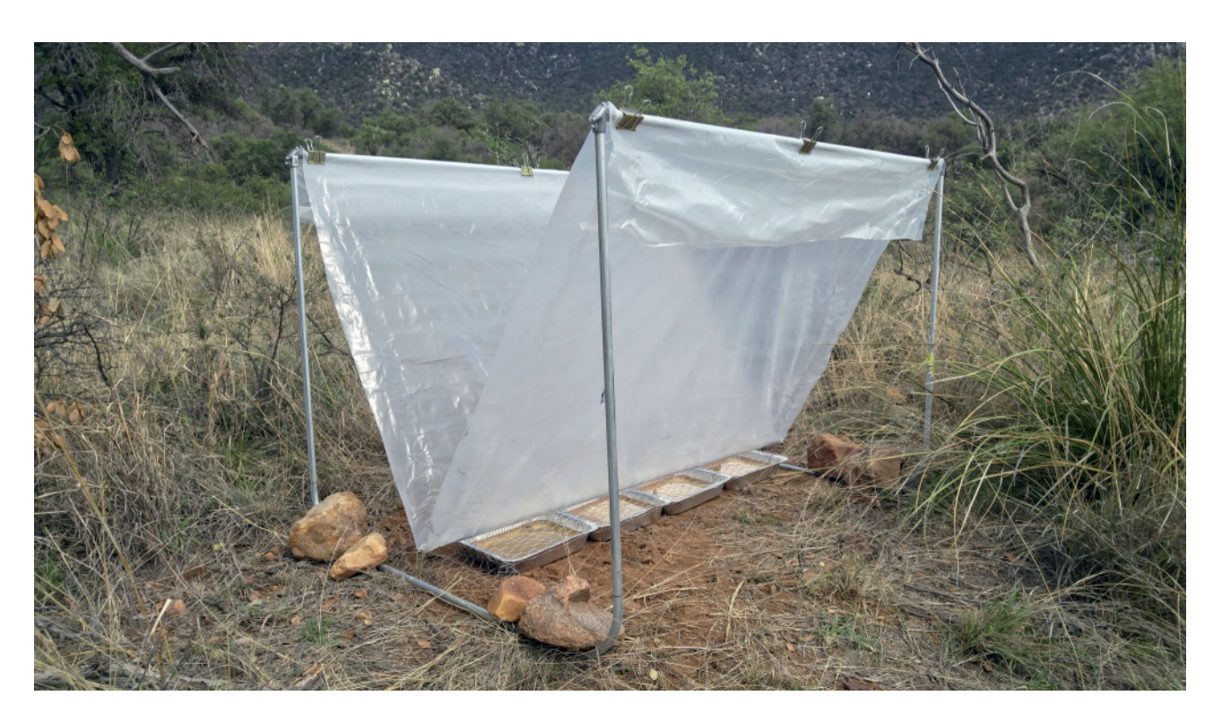
Fig. 1. V-flight intercept trap, with metal frame.