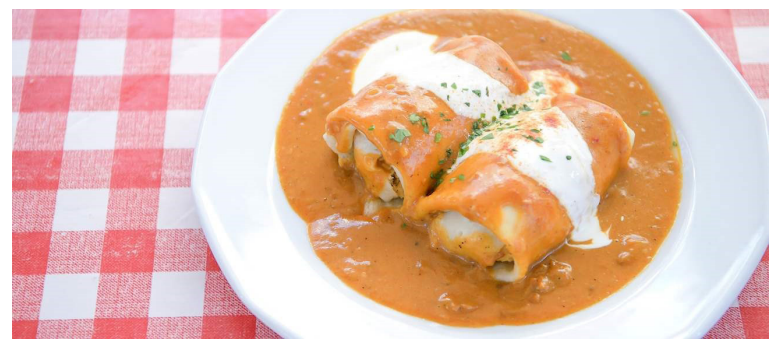
Best wishes from Gyongyi and colleagues in Hungary