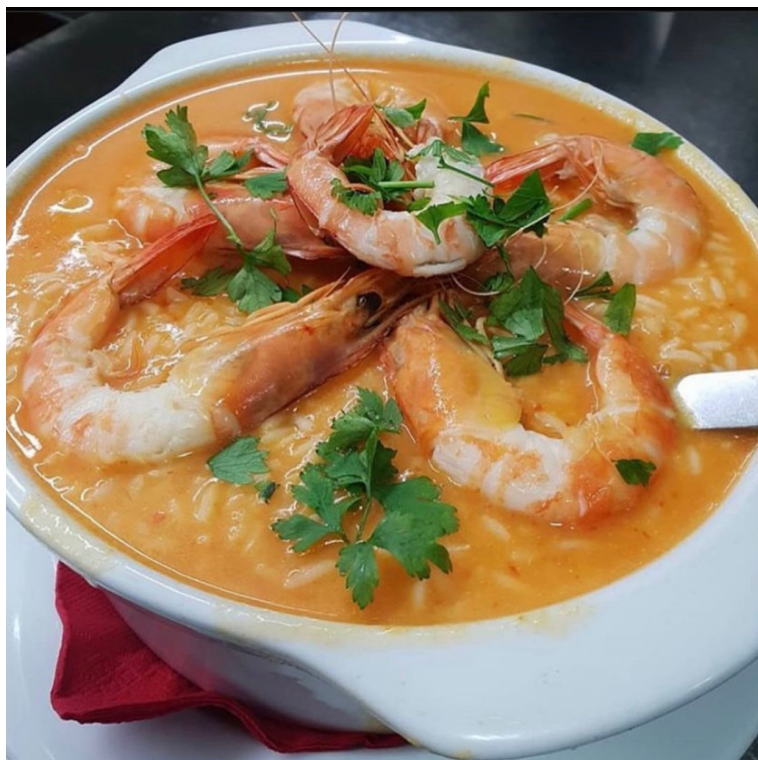
The picture was a courtesy from Pekados do Mar restaurant in Apulia, Portugal

Turn off the heat, sprinkle with chopped coriander and serve immediately.