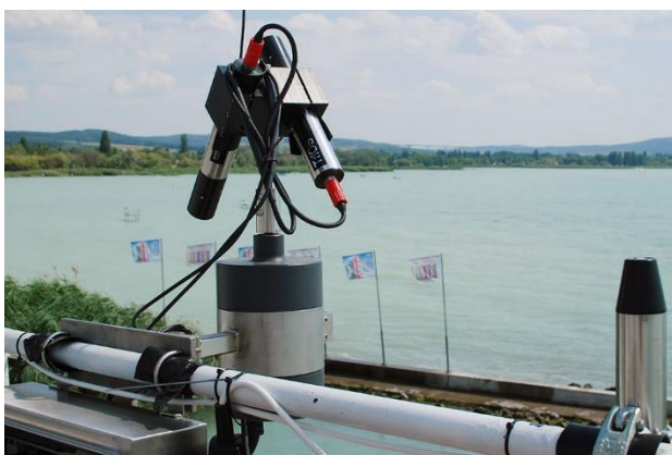
Figure 2 So-Rad on a car ferry

Observing in situ reflectance with sensors on the So-Rad is used to validate satellite observations, particularly the performance of algorithms that separate atmospheric and water-leaving radiance, which have high uncertainty in optically complex waters such as coastal seas and inland waters. High-quality reference measurements are required, collected under optimal observation conditions (solar and viewing azimuth, sun elevation).