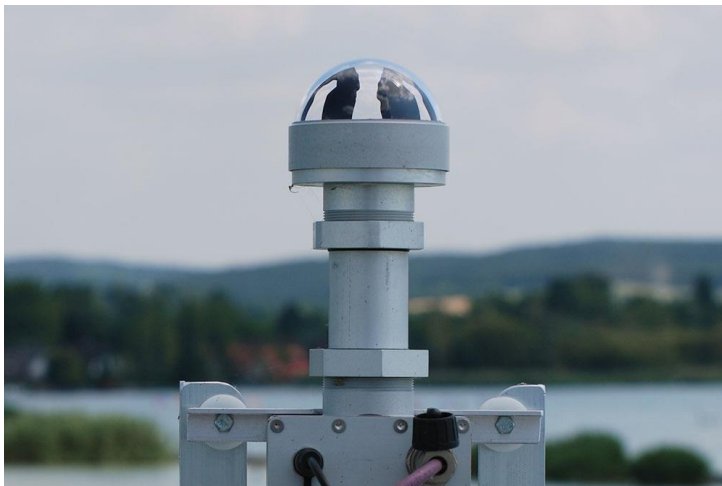
Figure 1 HSP-1 sensor