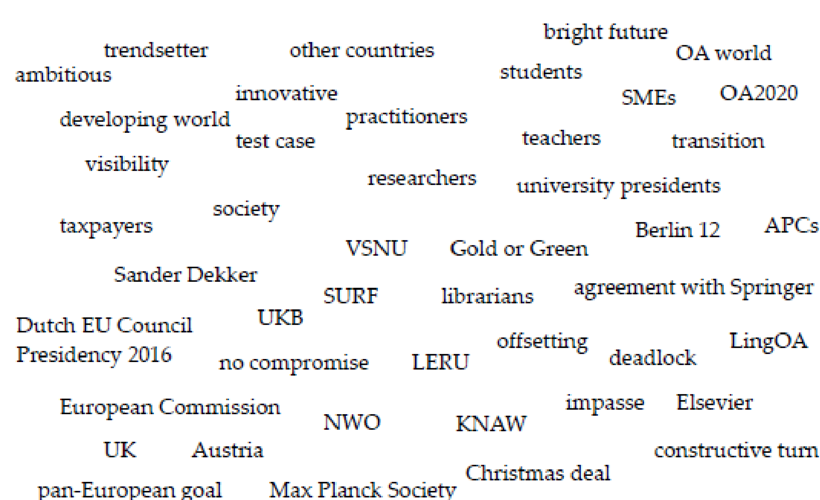
Figure 1. Abstract situational map: Messy/working version