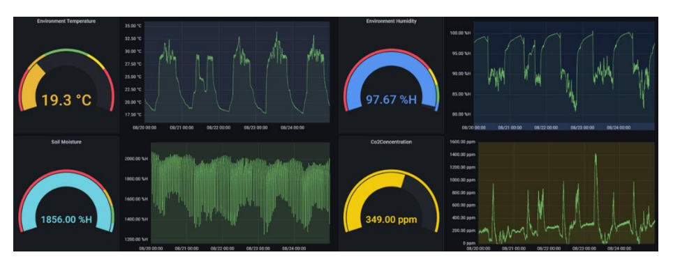
Fig. 3. Grafana dashboard showing temperature, humidity, soil moisture, and CO2

This IoT device was used to capture data related to the environment. Designed with ESP32 microcontrollers [13] and Wi-Fi connectivity at 2.4 GHz, the average range for this device is 30 meters to an available access point which adequate for greenhouses.