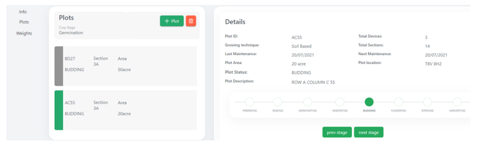
Fig. 4. Crop Panning use case to manage plots/sections and crop stages

For example, the farmer can record descriptive attributes of the seeds used in a specific crop, its batch number, supplier, and available supply, among other characteristics, and trigger rules based on specific criteria. Having specified the characteristics and production parameters, the system allows the farmer to select specific plots or sections of the greenhouse where a batch of seeds was planted, and automatically correlate sensor data to the crop. As crops evolve in time, the farmer can update this transition from one stage to the next one (i.e., from sowing to harvesting, etc.). During harvesting, a commercial scale connected via Bluetooth or Wi-Fi allows to record the partial weights of a given batch. In upcoming developments, the weight data will be used as a reference variable to estimate the performance of the whole farm. In addition, calculations derived from the DL components will be included, thereby detecting growth variations and aggregating existing data. This set of mechanisms, and further digital twin tracking, will allow the farmer to certify the quality of the final product, by integrating and adding verifiable information throughout the food supply chain.