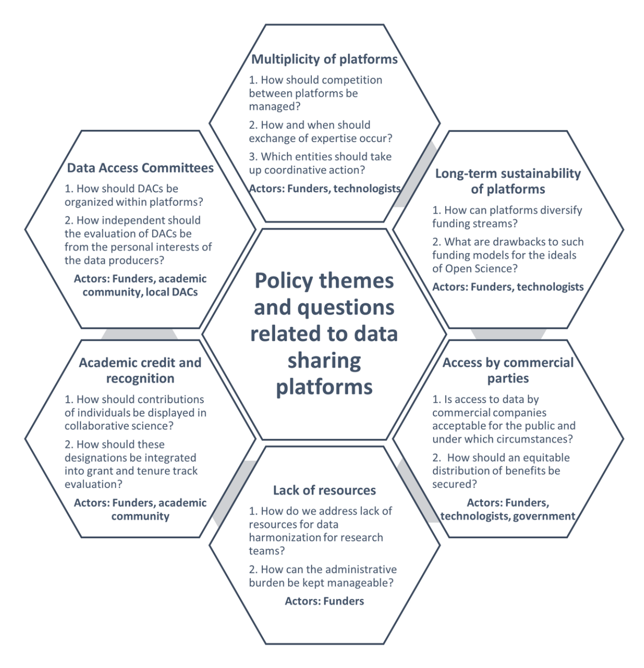
Figure 1. Key questions on each policy theme.

platform under development by the BigData@Heart project and the European Health Data Evidence Network (EHDEN), could have overlapping functions with the euCanSHare platform. Therefore, the multiplicity of platforms was raised as a concern amongst workshop participants, specifically regarding platform competition, overlap, sustainability and potentially redundancy. Data sharing platforms may compete on separate levels – data deposition, data analysis and funding application – with each level subject to its own competitional dynamics. We outline these three levels in the following paragraphs.