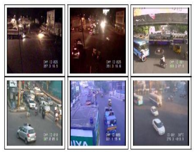
Fig. 2.Videos of accident that are recorded during various lighting conditions [20] [Best viewed in colour]

For developing effective accident detection system, collection of data set from CCTV surveillance videos is necessary. Data set must include videos of accident cases for various conditions as shown in Figure 2. Further, availability of public data set is also necessary so that other researchers can compare their results. Size of data set also matters as larger data set will be helpful to generalize results obtained during the research.