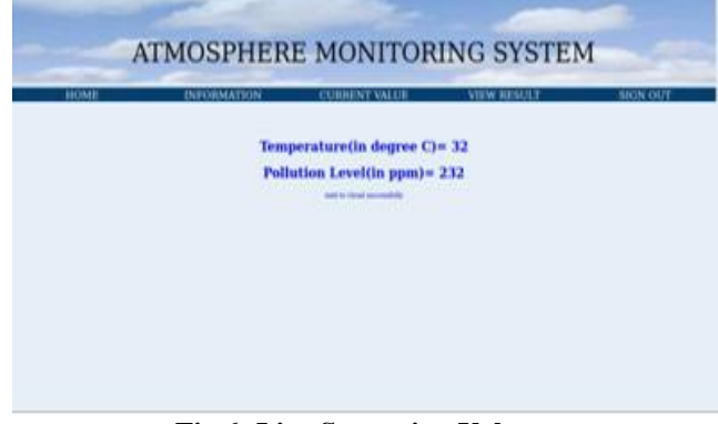
Fig.6: Live Streaming Value

Fig.5 shows the basic information to the user that having current value and get results tabs.if we click on the get results tab it displays current current temperature and pollution level to the user that is shown in below Fig.6.