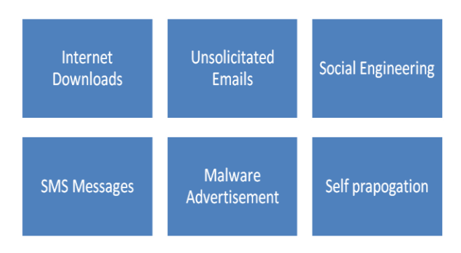
Fig 4.1 Entry points of Ransom ware