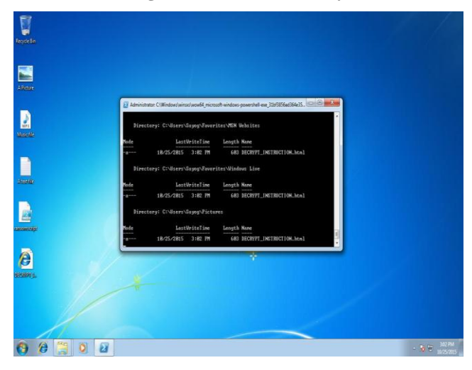
Fig 10, 2 Execution anatomy