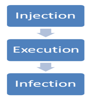
Fig. 5.1 working of attack

First it is very important that to understand how attack actually works. Looking to the facts of its damage, it is evident that ransom ware is not like any other attack, which can be easily detected and prevented by putting/tuning some security products, but it is much more than that. Shown in figure [5.1] As per our preliminary research, we have divided the entire process into phases which will give a clear understanding of the same. The proposed paper has explained the working and the authors have divided the working into three main parts that is the first step is attack here the injection to the system with