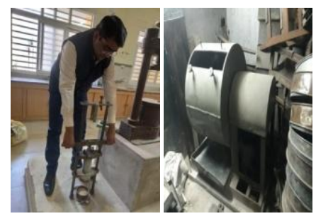
Fig. 3: Laboratory setup and Equipments for AIV and LAAV tests (IS: 2386-Part 4)